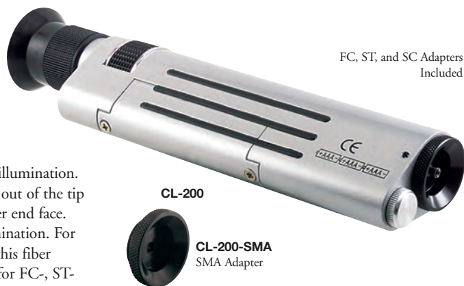
FC, ST, and SC Adapters Included

The CL-200 fiber microscope utilizes a white LED for coaxial illumination. Light is introduced into the optical path (axis) so that it comes out of the tip of the objective and strikes the sample perpendicular to the fiber end face. It produces an excellent detailed image of scratches and contamination. For critical examination of polish quality, we strongly recommend this fiber inspection scope. The inspection scope comes with an adapter for FC-, ST- and SC-terminated fibers. (Batteries Included)