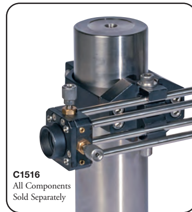
C1516 All Components Sold Separately