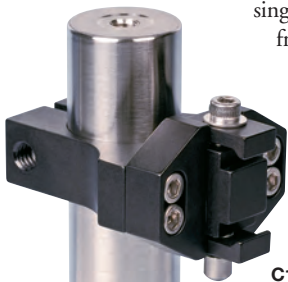
C1016 Post Not Included

The C1016 and C1516 Mounting Post Cage Adapters were designed to mount our 16 mm Cage Assemblies securely to our Ø1.0" or Ø1.5" Series Mounting Posts, respectively. A quick-connect mechanism on the front of the clamp is activated by a single hex wrench for fast drop-in/drop-out of the cage assembly from the clamp. A 3/16" (5 mm) hex clamping screw is located on the rear of the clamp to allow the user to easily install and remove the entire clamp from the post while keeping the cage system in tact.