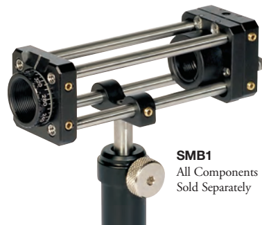
SMB1 All Components Sold Separately