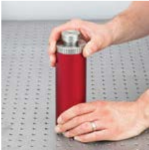
Click to Enlarge Step 1: Loosen the Locking collar, and raise the threaded portion of the post.

The PHY12P(M) Adjustable-Height Support Columns are designed to support a breadboard or microscope stage. Each post has a top-located 1/4"- 20 (M6) tap and a universal base that has four 1/4" (M6) counterbored holes on 2" (50 mm) centers for mounting it to an optical table or optical breadboard. The height of the post is continuously adjustable from 8" to 12", and its position can be locked using a knurled ring locking collar. To secure the columns to an optical table is as simple as loosening the locking collar and raising the red housing. This will provide access to the four counterboard 1/4" (M6) mounting holes.