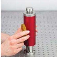
Click to Enlarge Step 2: Raise the red cover and attach the post base to the table.