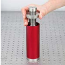
Click to Enlarge Step 3: Lower the red cover, ensuring the dowel pins in the base are aligned with the holes in the cover. Adjust the post to the desired height, and then lower the locking ring to lock the height.