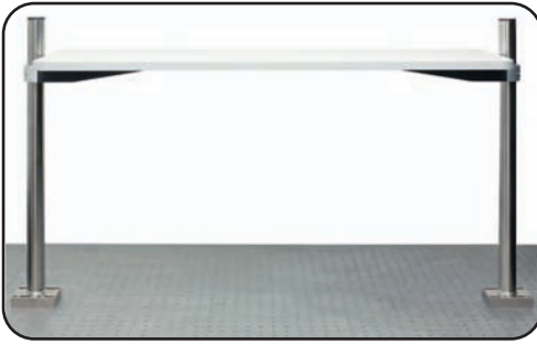
Two TA2 Post Mount Adapters shown with PSY211 Overhead Shelf (Posts and Shelf Sold Separately)