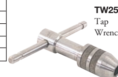
TW25 Tap Wrench