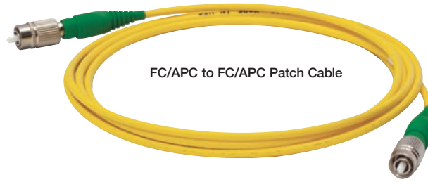
FC/APC to FC/APC Patch Cable