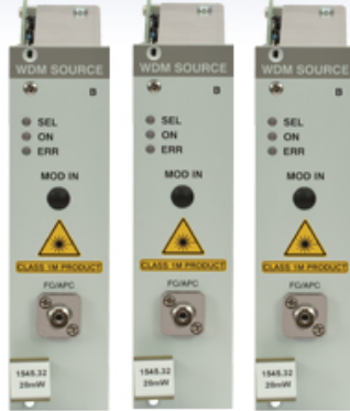
PRO8 DWDM Laser Modules