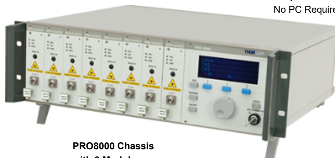
PRO8000 Chassis with 8 Modules

Easy to Read Display No PC Required for Operation