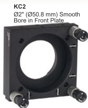
KC2 Ø2" (Ø50.8 mm) Smooth Bore in Front Plate