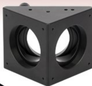
KCB2 Tapped Cage Rod Holes