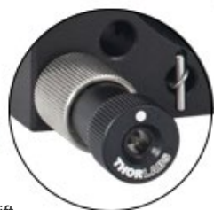
Anti-Drift Locking Collar