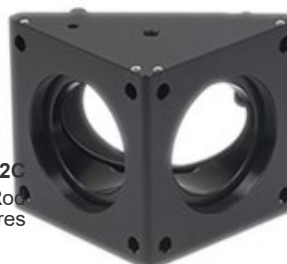
KCB2C Smooth Cage Rod Bores