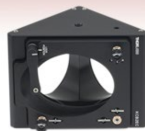
KCB2EC Right-Angle Mount for Elliptical Mirrors