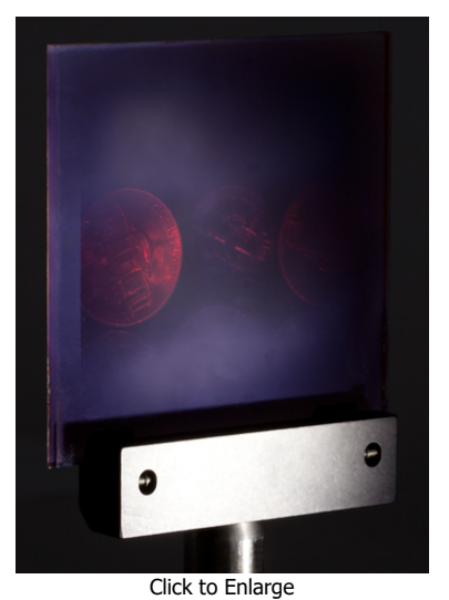
Click to Enlarge Figure 3: A reflection hologram viewed by transmitting light through the plate.

Transmission holograms must be illuminated with the laser used to expose the plates in order for the image to be visible.