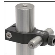
Click to Enlarge A Ø1/2" Post Mounted Perpendicularly to a Ø1" Post Using the RA90RS Clamp

The C15QR(M) handle can replace the 1/4"-20 (M6) clamping screw for better control when adjusting the clamps. Note that the C10QR(M) handle is not compatible with these clamps.