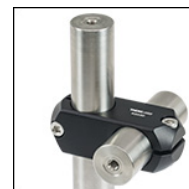
Click to Enlarge Two Ø1" Posts Mounted Orthogonally Using the RSA90 Clamp

Thorlabs' RSA90(M) Right-Angle Clamp allows one Ø1" (25.0 mm) post to be mounted perpendicularly to another Ø1" (25.0 mm) post. The clamp features a highly stable flexure lock design that is secured using a 3/16" (5 mm) balldriver. The center-to-center distance between the two posts is 1.25" for the imperial version and 30.0 mm for the metric version.