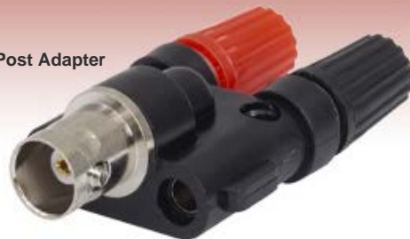
Binding Post Adapter