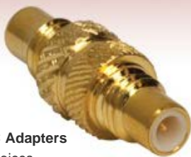
SMC Adapters 2 Choices