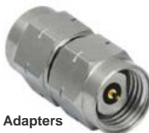
2.4 mm Adapters 7 Choices