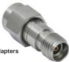
2.92 mm Adapters 7 Choices