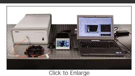
The setup for testing the relationship between LED wavelength and current. See the table below for a complete item list.

LEDs have relatively broad, asymmetric emission profiles. The centroid wavelength of an LED is a weighted average of the wavelength across the emission profile (following a similar concept to center of mass calculations). It is defined as