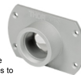
LED4B1 Adapter to Couple Liquid Light Guides to the 4-Wavelength Source