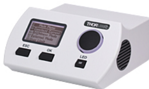
Ideally Operated by DC4100 or DC4104 Drivers