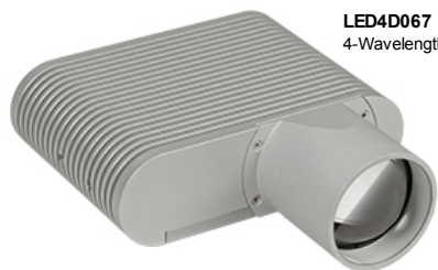
LED4D067 4-Wavelength High-Power LED Source