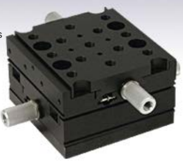
DT25A Riser Plate Sold Separately

Dovetail Translation Stages 1/2" (12.7 mm) Travel