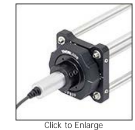
CPS980 Module Held in an AD11F SM1-Threaded Adapter and Mounted into a CP90F Quick-Release Cage Plate Within a 30 mm Cage System

For single-frequency applications, our collimated 850 nm VCSEL Module produces a single-wavelength output and a round, Gaussian beam shape