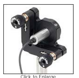
CPS850 Laser Diode Module Held in an AD11NT Unthreaded Adapter and Mounted into a KM100 Kinematic Mount

CPS450 Laser Diode Module Held in a KAD11NT Unthreaded Kinematic Adapter and Mounted into an FMP1 Fixed Optic Mount