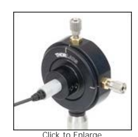
CPS980S Laser Diode Module Held in an AD8F SM1-Threaded Adapter and Mounted into an LM1XY XY Translation Mount

without clipping the beam. This laser module features a 2 to 3 order of magnitude narrower linewidth than our other laser modules, but this comes at the expense of a lower total power output.