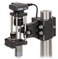
Click to Enlarge 30 mm Cage System Vertically Mounted on a Ø1.5" Post Using a CV1526 Clamp

The application to the right shows the CV1526 mount supporting a 30 mm cage system in a vertical orientation. The assembly is composed of four ER4 cage rods, an SM1Z Z-Axis Translation Mount, and a CP02T cage plate. This configuration can be used in a variety of applications including the inspection station shown to the right, which consists of a CMOS Camera, a Camera Lens, and a Microscope Objective.