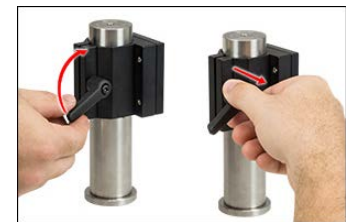
Click for Details

Left: Handle Being Attached to the C1501 Post Mounting Clamp