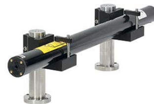
Click to Enlarge HeNe Laser Mounted on Two C1502 V-Clamps and Ø1.5" Posts

This mount includes one PM4(/M) Clamping Arm, which may be fastened at any of three positions along the outer edge of the V-clamp. Additional PM4(/M) clamping arms are sold below.