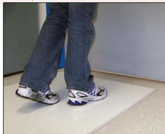
ESD2436 Multilayered Adhesive Mats