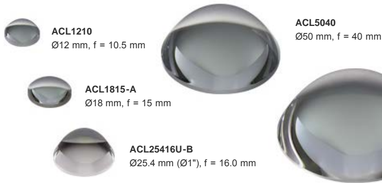
ACL7560-A Ø75 mm, f = 60 mm