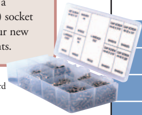
Hardware Kit #4-40 (M3)

The HW-KIT5 (/M) provides a generous supply of #4-40 (M3) socket head cap screws for use with our new mini-series optical mounts.