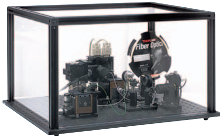
Shown With Plexiglass (Breadboard Sold Separately, See Page 16)

These enclosure systems attach directly to our MB Series Breadboards via the four counterbored mounting holes that are provided on all boards in this series. These enclosures are ideal for protecting delicate instruments that are constructed on the MB Series Breadboards. All enclosure systems have an internal height of 12" (30cm). For light-sensitive instruments, we offer an enclosure that has black hardboard sides. The enclosures are shipped