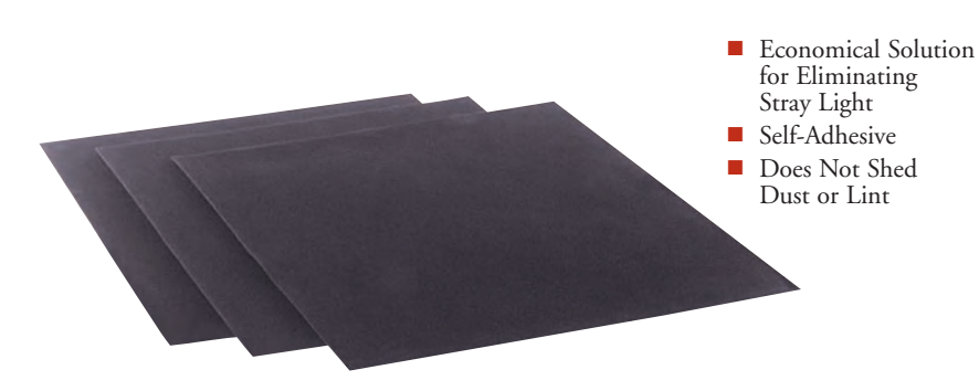
Image contrast can suffer when stray light reaches the focal plane of an application where the light path travels through a tube or other enclosed area. Although applying a flat, black paint to the inside may help, a textured, matte, black surface is much more effective. For large angles of incidence, this flocked, self-adhesive paper absorbs

virtually 100% of the light that strikes it. In addition, the fibers will not shed dust or lint, unlike some velvet and felt materials. When compressed, this flocked paper is approximately 0.015" (0.381 mm) thick with the backing and 0.012" (0.305 mm) thick without the backing. Caution: Do not cut the BFP1 with a laser cutting tool.